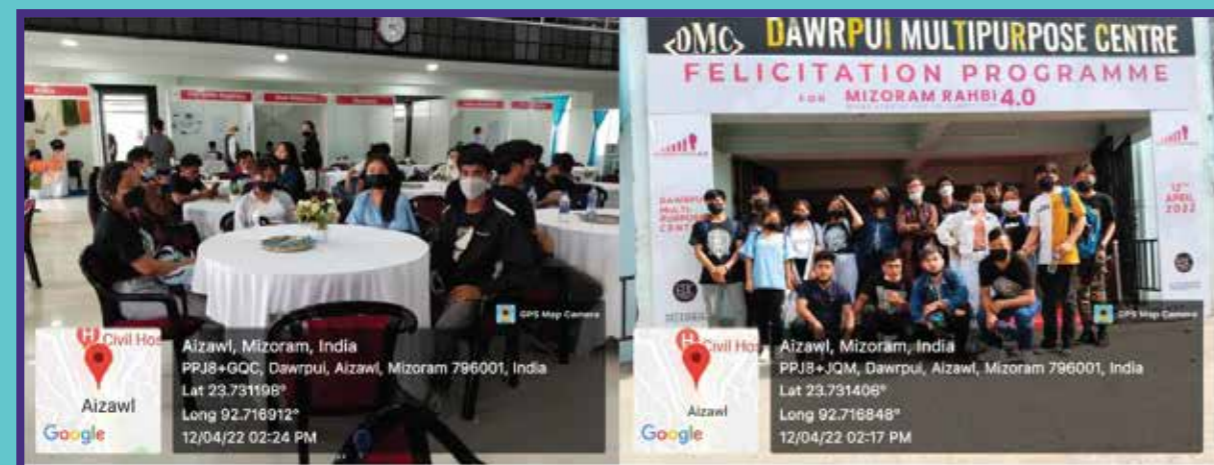
Figure B: Homepage of EDC Mizoram Portal

More than 12 Startups were sanctioned a cumulative sum of INR 73+ Lakhs as Micro Startup Grant.