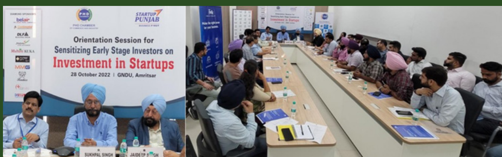
Figure K: Snapshots of Orientation Session for Sensitising Early-Stage Investors on Investment in Startups

More than 30 participants, including senior officials from the Punjab Government, entrepreneurs, and office bearers from various industrial associations, manufacturers or traders, and senior management personnel attended the programme.