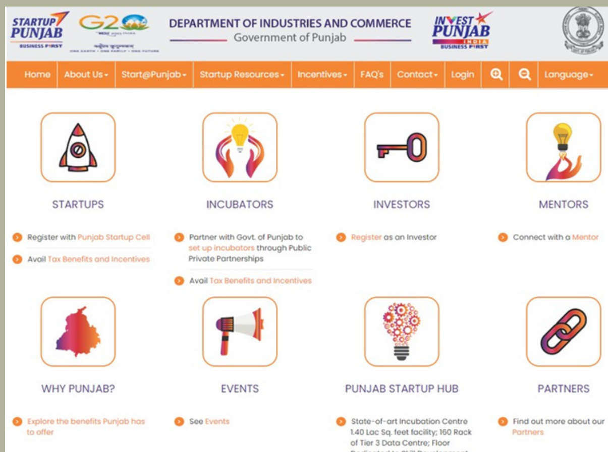
Figure B: Homepage of Startup Punjab

The State Startup policy is available on the portal for easy access to Startups. The Punjab Industrial and Business Development Policy 2022 aims to facilitate manufacturing and service sectors by creating an investor-friendly environment in Punjab. It focuses on the development of sustainable business models that can withstand competition from other businesses within India and the world. Apart from State Startup policy, State Government has more than five active policies in which Startup support has been provisioned.