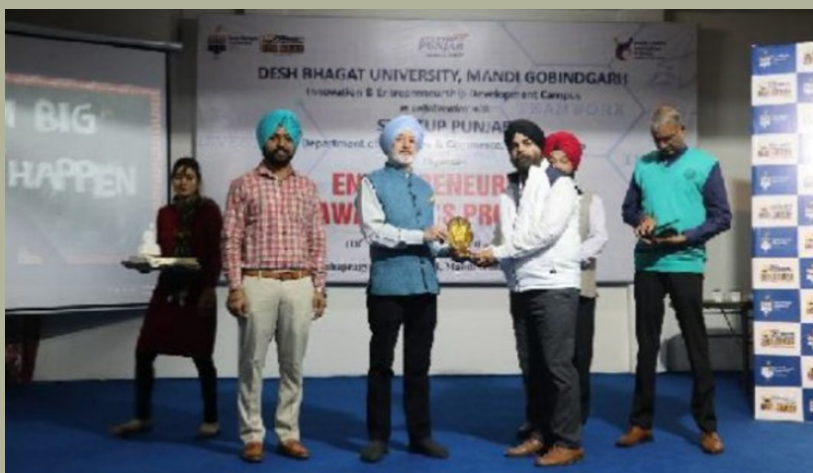
Figure E: Entrepreneurship Awareness Program held at Desh Bhagat University

A series of more than 10 workshops (Entrepreneurship Awareness Program) throughout Punjab was held at Higher Education Institutes (HEIs) of the State. Workshops centred on Startup operations, life cycles, and State support were conducted. Students gained insights into Government schemes, learning about benefits, support, and funding options. The sessions also covered procedures for scheme registration, emphasising the ease of access for entrepreneurs.