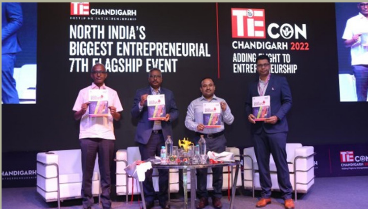
Figure F: Event Picture from TiECon Chandigarh 2022

Mega Startup Conclave 2022: Various stakeholders including the Government of Punjab, Chamber of Industrial and Commercial Undertakings (CICU), angel investors, and social entrepreneurs attended this event to be briefed on initiatives for industrial and business development policies of the Government. A competition was organised to announce the five best Startups and award the winners a prize of INR 21,000. The event also accommodated 5+ stalls by Startup Punjab-nurtured Startups.