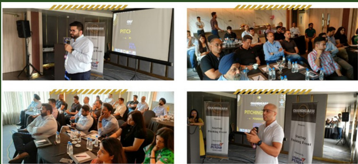
Figure I: Snapshot of pitching cum investors connect program

More than ~180 Startups were connected with 50+ potential investors through 10+ programs organised by the State Government in the period of consideration.