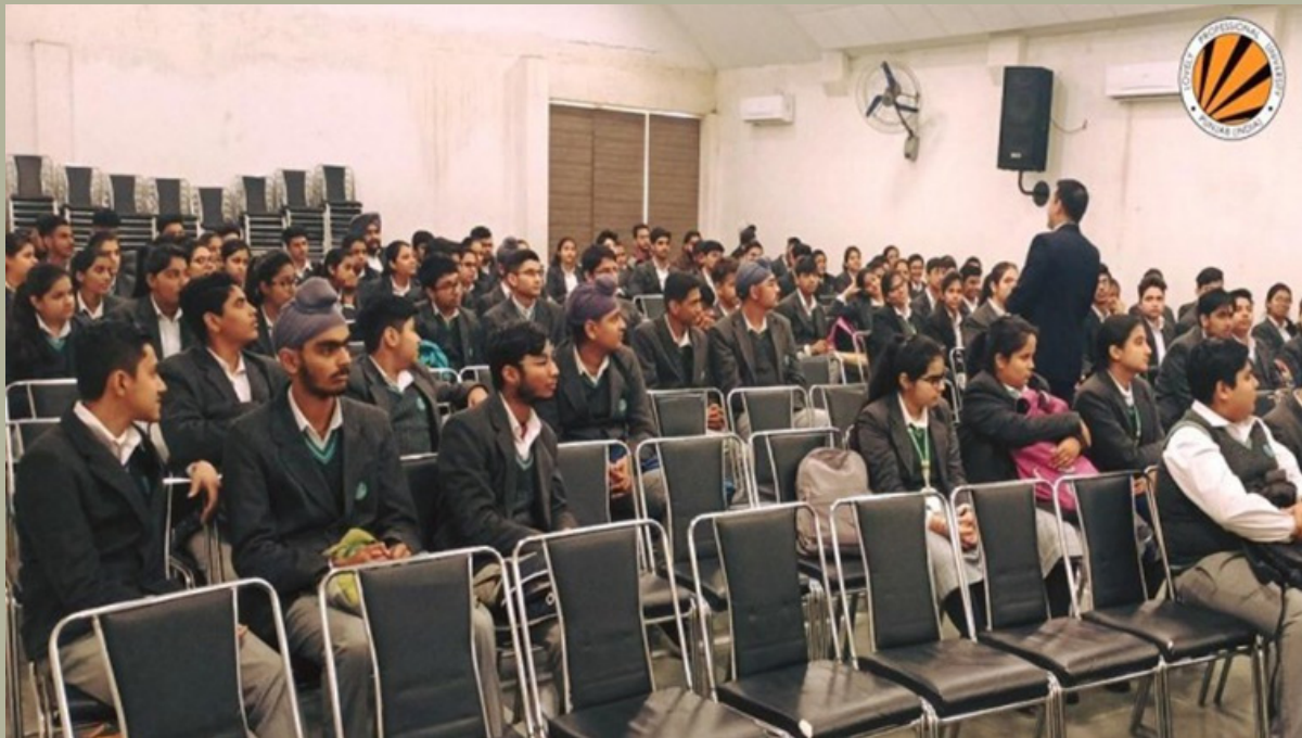
Figure D: Event picture from Entrepreneurship Awareness Program in Sandeepni Gurukul School, Pathankot

One of the event was “Entrepreneurship - How to Make Money from Your Ideas”. The workshop provided participants the required encouragement and business skills to help them establish a successful business. They learnt about building a business from zero by producing new ideas and turning those ideas into a profitable business