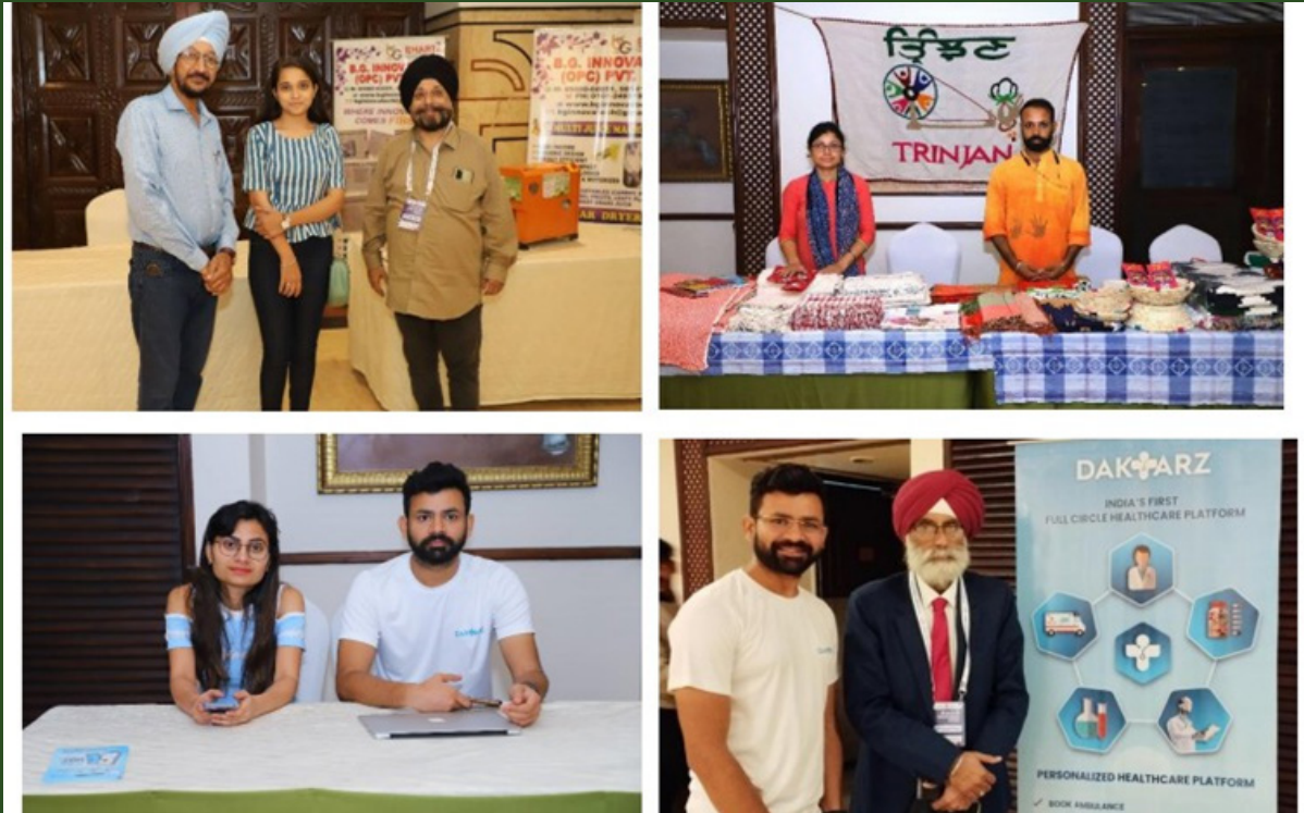
Figure 6: Exhibitors putting up Stalls at Mega Startup Conclave 2022

More than 10 such programs with a participation of ~350 Startups were organised by the State Government providing opportunity to Showcase their products and services.