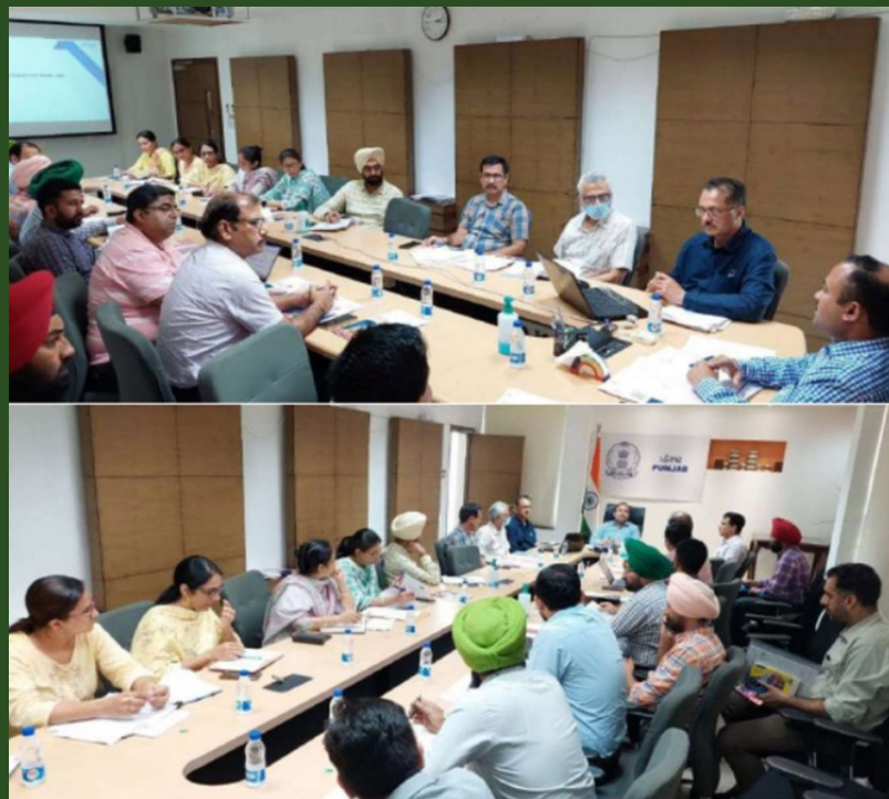
Figure J: Sensitisation workshop held on 15 September 2022

These workshops have played a crucial role in fostering collaboration between the Government and Startups, emphasising the importance of support mechanisms and encouraging departments to actively participate in the growth and success of emerging businesses.