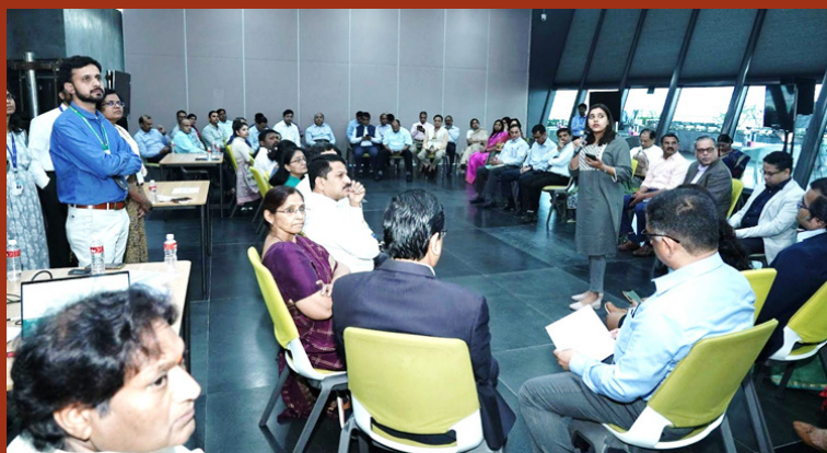
Figure G: Telangana State Innovation Council(TSIC)- Government Interaction Workshop