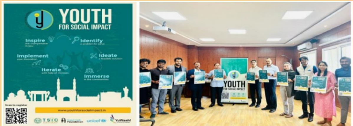
Figure B: Event Launch - Youth for Social Impact