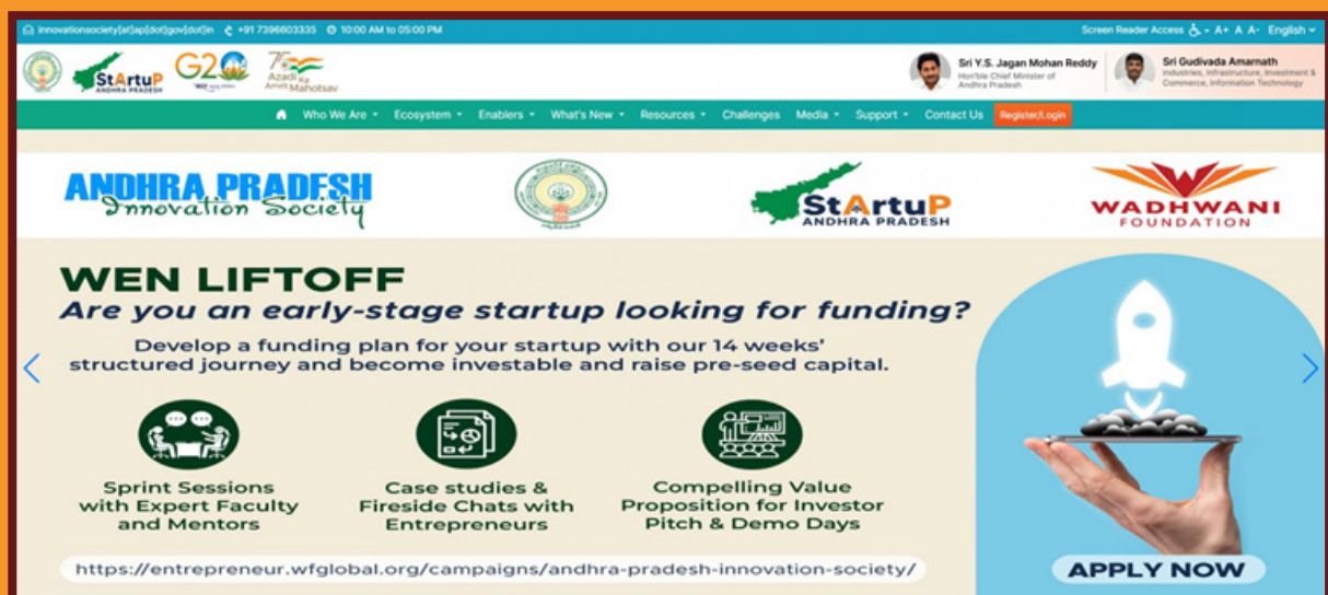
Figure B: Homepage of Startup Andhra Pradesh Portal

The State Startup portal captures investor queries and goes beyond grievance resolution, incorporating a feature that welcomes user suggestions and feedback. The login page also gives the option to users of “Sign in with Startup India” which enables Department for Promotion of Industry and Internal Trade (DPIIT) recognised startups to automatically log in without the hassle of registration again on the State portal.