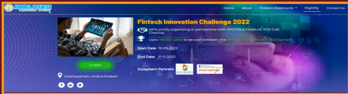
Figure G: Andhra Pradesh Innovation Fintech Challenge 2022 on Startup Andhra Pradesh Portal

State has been undertaking various events providing funding opportunities to the Startups. An example of a program offering fiscal support was the Andhra Pradesh Innovation Fintech Challenge 2022 for scouting innovations and Startups. It focused on emerging technologies such as Internet of Things (IoT), Artificial Intelligence (AI), Machine Learning (ML), Data Science, Analytics, Smart Decision tools, Blockchain and Robotics