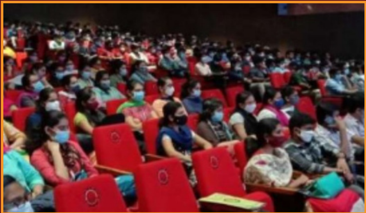
Figure E: List of Mentors on Startup Andhra Pradesh Portal

More than 25 Startups displayed their products and services in their stalls and 100+ student and faculty teams participated in various events and pitching competitions during the Fest. 2,500+ students from various academic disciplines and 400+ university faculty visited these stalls.