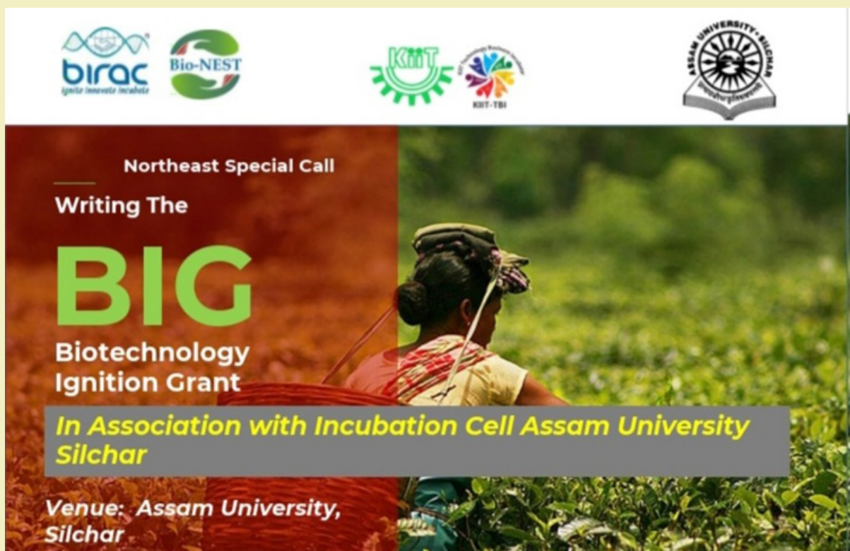
Figure B: Biotechnology Ignition Grant (BIG) Programme conducted by Assam University

The Incubation Centre has organised various entrepreneurship summits in collaboration with EDII (Entrepreneurship Development Institution of India) and organised different industrial motivational workshops sponsored by MSME.