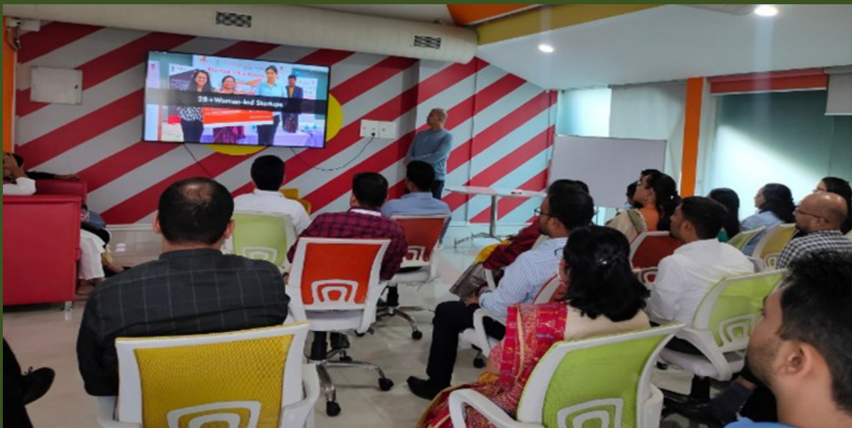
Figure E: Sensitisation workshop for Assam Civil Service officials

The Government of Assam also conducted sensitisation workshops for the Assam Civil Service officials with an objective to gain a better perspective on the germination and gradual evolution of a Startup culture in Assam.