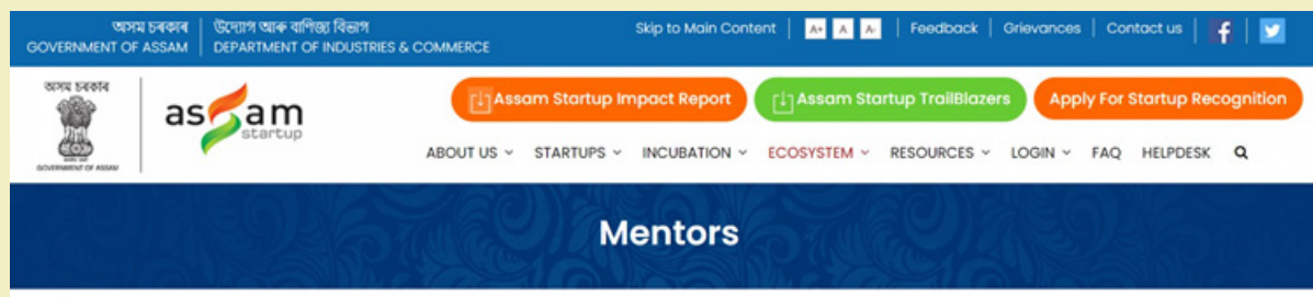
Figure D: Startup Assam – Mentor Portal

Startup Assam has an ever-growing pool of mentors who are the driving force of the Startup ecosystem. During the incubation period each Startup is assigned to a matching mentor. The mentor will be to guide the Startup incubates and provide necessary advisory and expert advice as and when required. The mentors helps the Startup develop action plan and provide valuable inputs to the Startup in term of business planning, product or service development, market penetration strategy, branding and networking, financial links, and Government grants and schemes.