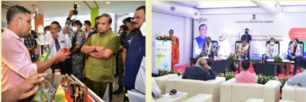
Figure C: Snapshots of UDYAM ASSAM 3.0 Initiative

Assam Startup - The Nest, an initiative by the Department of Industries and Commerce in association with IIM Kolkata (Calcutta) Innovation Park, organised UDYAM ASSAM 3.0 on 16 August 2021. The event commemorated the success and impact stories of Assamese Startups as well as encouraged the Startups to continue with their entrepreneurial journey. An exhibition showcase platform was also set up for the incubates to display their product offerings.