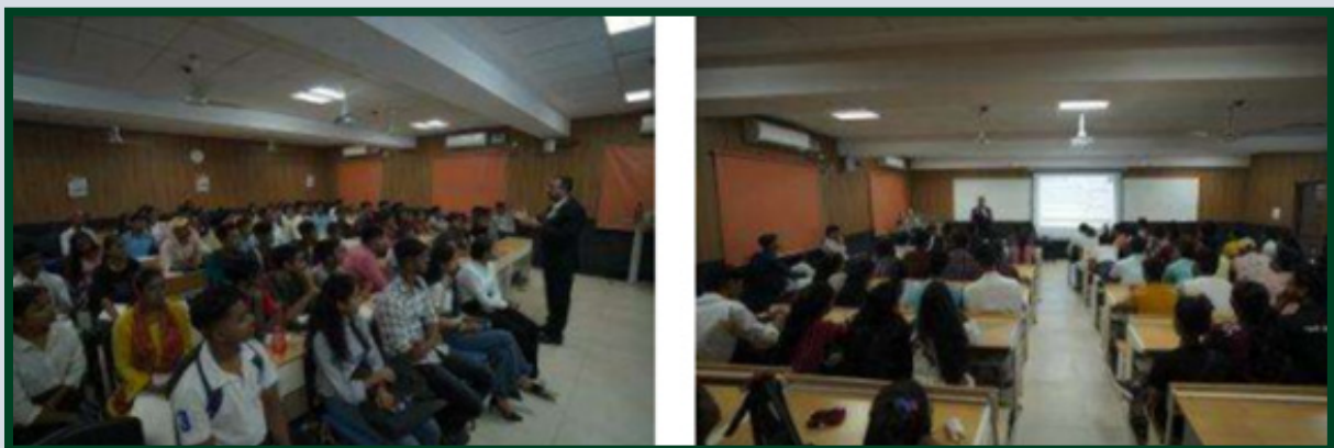
Figure 1: Snapshot of product showcase event by Delhi Government

Bootcamp for Class XII Business Blasters Team: A one-day boot camp was organised on June 16, 2022 for the Business Blaster Incubates at the DSEU Dwarka campus. The camp held a series of learning-oriented sessions to help students learn basic fundamentals of marketing, how to develop their personal brand, legal issues to consider as an entrepreneur and introduction to company formation.