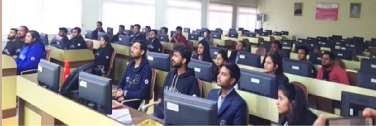
Figure A: Entrepreneurship Opportunities Recognition at Graphic Era University

In collaboration with Stateinstitutes such as Dehradun Institute of Technology (DIT), Dehradun and Graphic Era University, Startup Uttarakhand has conducted workshops on subjects such as Entrepreneurial Practices In Global Era: Startup Success, The Joy of Being an Entrepreneur, Entrepreneurship Opportunities RecognitionStory, and various demo days and investor meets.