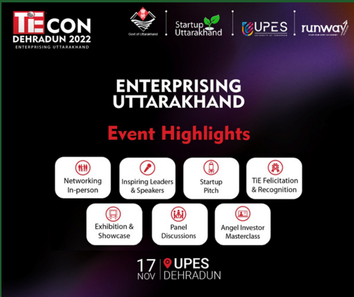
Figure B: TIECON Dehradun 2022 event brochure